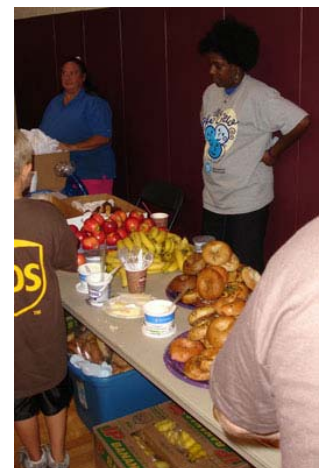
5 th Annual Domestic Violence Awareness 5K Walk – Taking Steps to End Abuse!